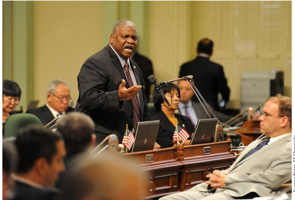
Susana Bates, SF Chronicle

Increases up to $20,000 the fine against a person convicted of pimping, pandering, or procurement of a minor and directs half of these funds to community-based organizations